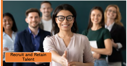
Recruit and Retain Talent