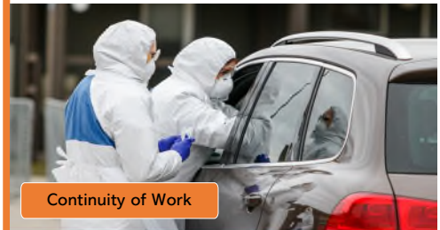
Continuity of Work